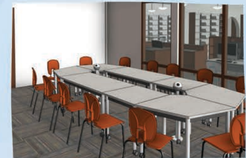
Future Renditions of the Brandon Public Library