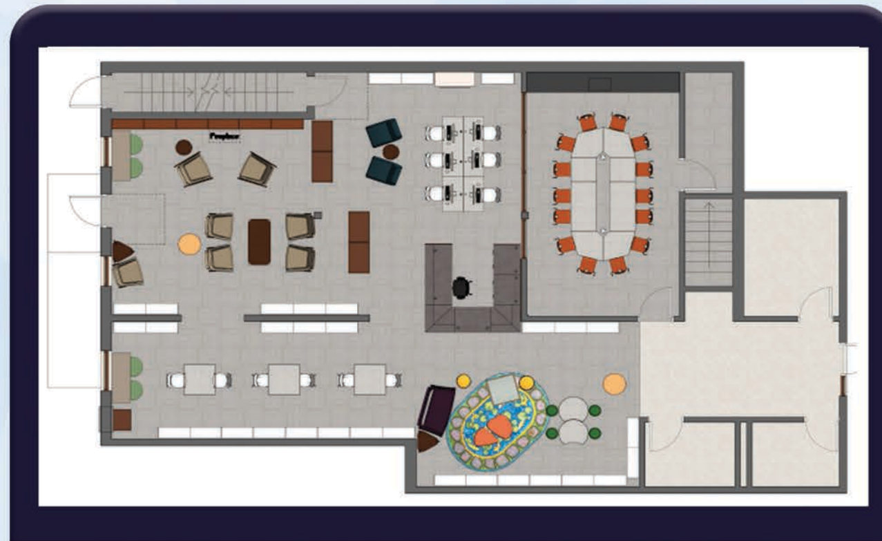
Future Floor Plan of the Brandon Public Library

The modernized Brandon Public Library will honor the past while looking to the needs of the future. Through much community input, planning, and consideration, the revitalized library will remain in its historic building, but be updated and expanded with a one-story additional wing to better serve the needs of today. The alleyway was purchased to allow for the expansion to double the library space in a fiscally responsible manner, and fundraising will be necessary to bring improvements to completion.